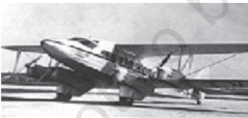
Fig.1.5 Tata Airlines, a division of Tata and Sons, was established in 1932 inaugurating the aviation sector in India

cost to the government exchequer, yet, it failed to compete with the railways, which soon traversed the region running parallel to the canal, and had to be ultimately abandoned. The introduction of the expensive system of electric telegraph in India, similarly, served the purpose of maintaining law and order. The postal services, on the other hand, despite serving a useful public purpose, remained all through