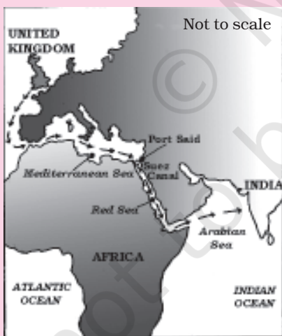
Fig. 1.2 Suez Canal: Used as highway between India and Britain

Various details about the population of British India were first collected through a census in 1881. Though suffering from certain limitations, it revealed the unevenness in India's population growth. Subsequently,