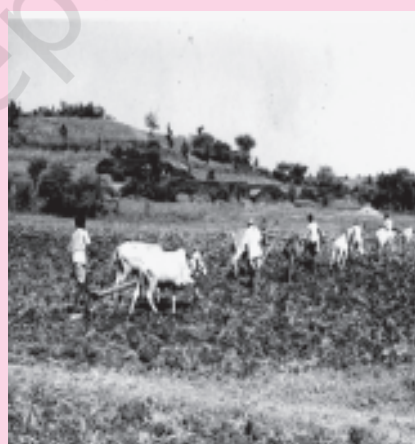
Fig. 1.1 India's agricultural stagnation under the British colonial rule

The French traveller, Bernier, described seventeenth century Bengal in the following way: "The knowledge I have acquired of Bengal in two visits inclines me to believe that it is richer than Egypt. It exports, in abundance, cottons and silks, rice, sugar and butter. It produces amply — for its own consumption — wheat, vegetables, grains, fowls, ducks and geese. It has immense herds of pigs and flocks of sheep and goats. Fish of every kind it has in profusion. From rajmahal to the sea is an endless number of canals, cut in bygone ages from the Ganges by immense labour for navigation and irrigation."